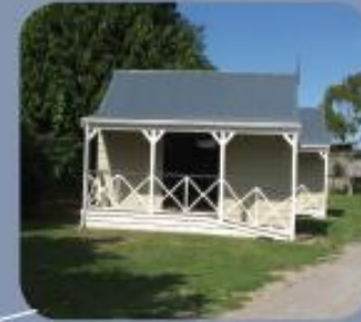
Cabins: Sleep 8