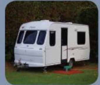
80 Powered Campsites