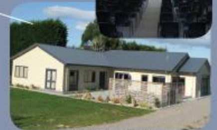
Pacific Court Conference Centre